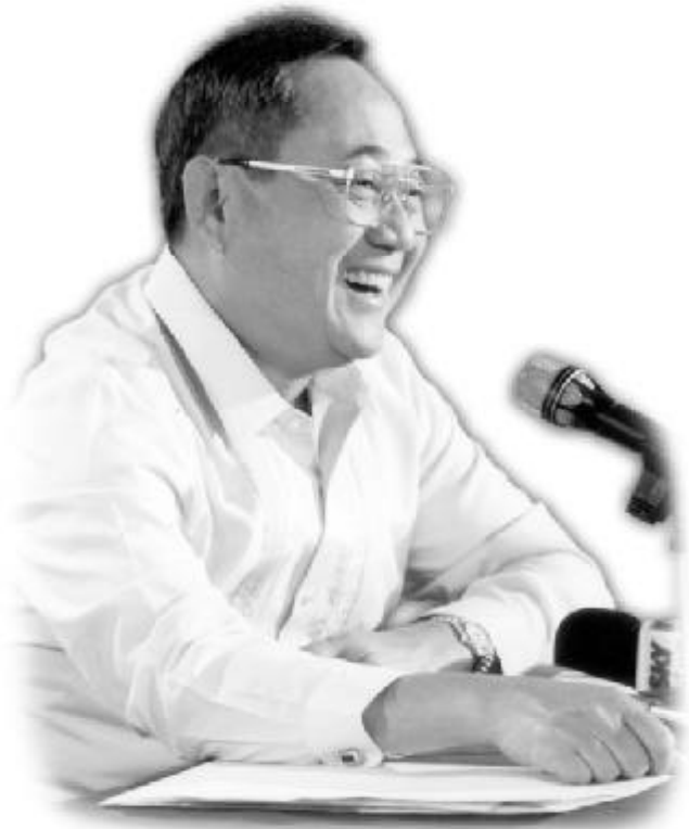
SPEAKER JOSE C. DE VENECIA

T he leadership of the House of Representatives in the 12 th Congress is one that is borne out of a strong collegial determination to establish the most urgently required policies of governance at a crucial period of national transition.