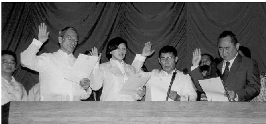
BAYANMUNA Representatives take oath of office.