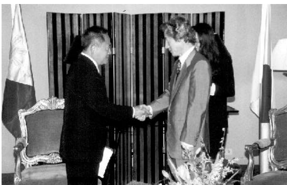
SPEAKER DE VENECIA discussed with Japanese Premier Junichiro Koizumi the proposed Asian Monetary Fund (AMF) during the latter's visit to the country.

As Speaker de Venecia aptly articulated, the goal is to "transform our house into an activist, reformist, achievement- and performance-oriented House, a bastion of good politics."