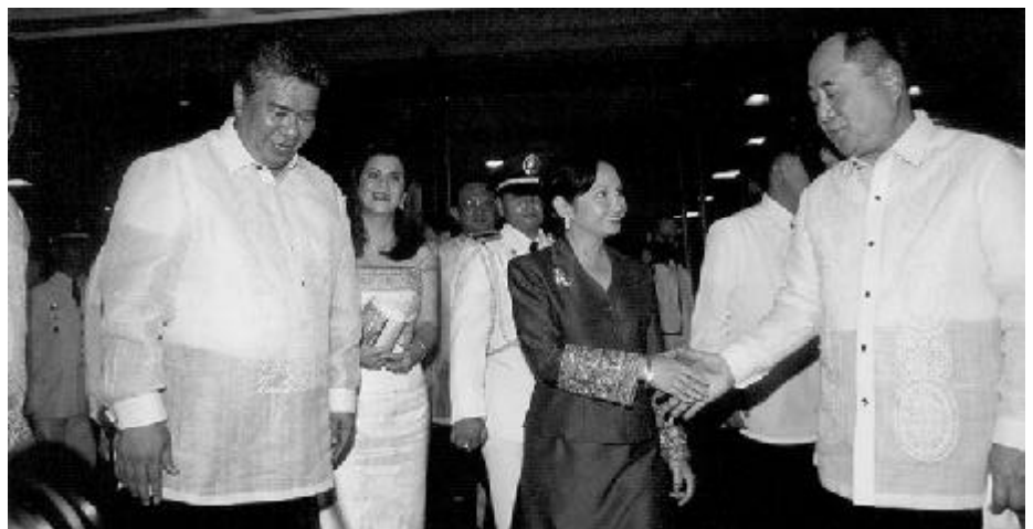
De Venecia vowed a legislative program that will support the President's anti-poverty agenda.