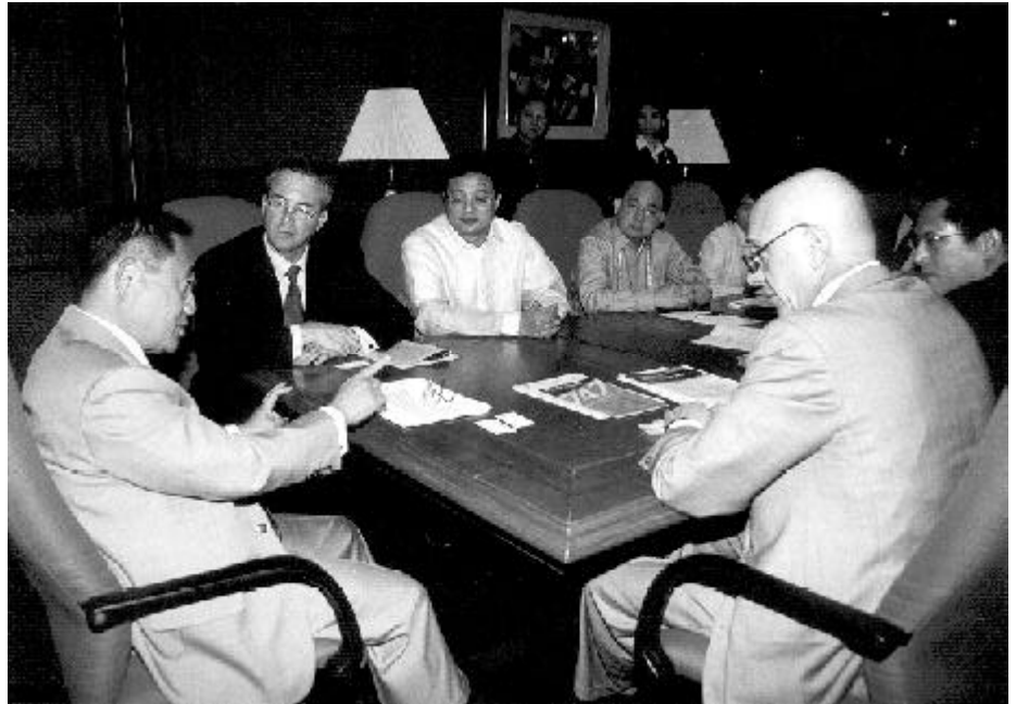
Representatives of international financial advisor Ernst & Young of Asia-Pacific Financial Solutions LLC discussed with the Speaker the possibility of tapping the banking sector's P500-B NPLs.

Securitization of government assets would enable the country to raise the counterpart funds required for official development assistance (ODA) already committed by Japan and European